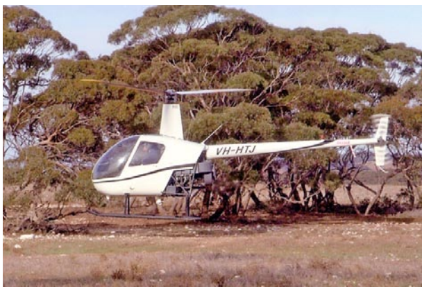
Figure 1 Robinson R22 helicopter.

Selected areas in the Flinders Ranges Project tenements will be subject to detailed scrutiny for kimberlite targets by a new high-resolution helimag survey which commenced today. A photograph of the Robinson R22 helicopter conducting the survey is shown on Figure 1. Survey areas are shown in Figure 2. Flying will commence on Area 2 near Pine Creek. The survey is using state-of-the-art magnetometer and laser altimeter equipment to take readings at one metre intervals across the ground, representing a thirty-fold increase in data density compared with conventional surveys. This will allow fast and accurate definition of new kimberlites in the Pine Creek and Peterborough areas, where recent trenching has established the presence of a new diamondiferous kimberlite field.