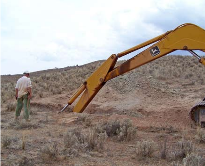
Figure 2 Trenching at H77a - 1 December 2006.

six microdiamonds in the 0.1 to 0.14 mm range. When normalised to a 20 kg sample weight the result is equivalent to 3 microdiamonds per 20 kg compared to 110 microdiamonds per 20 kg in the original sample.