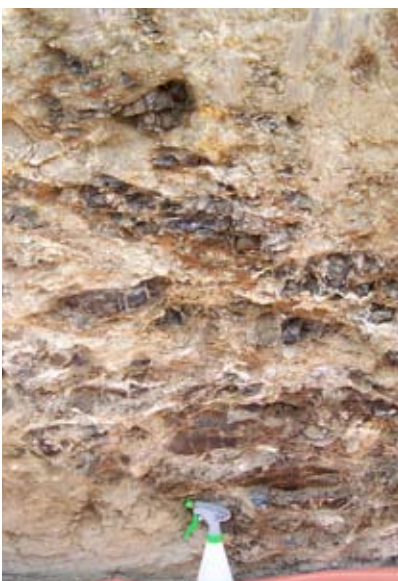
Figure 3 Northern face of new trench showing kimberlite with country rock xenoliths - 1 December 2006.

This variation in microdiamond results is not unusual. Significant diamond variability is common