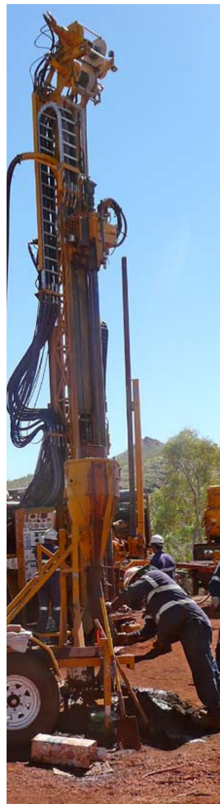
Drilling at Area E, Hamersley Project, 20 August 2008.

NB: These intersections are based on an Fe cut-off grade of 50% and a maximum internal dilution of 2m. Analysis via XRF fusion at SGS Laboratories. LOI – Loss on ignition