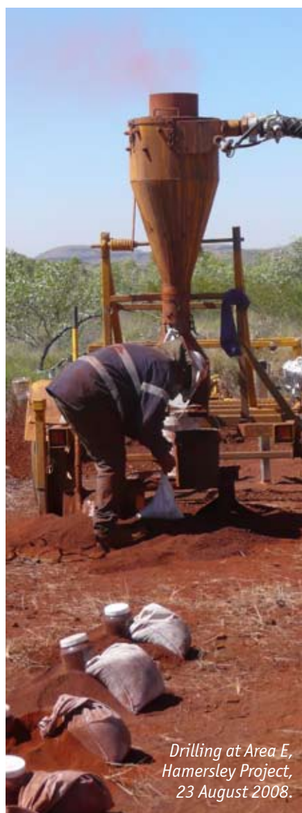
Drilling at Area E, Hamersley Project, 23 August 2008.