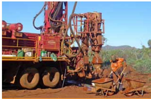
Reverse circulation drilling at the Pilbara Iron Ore Project, March 2011.

Based on the assays received to date, the significant intersections are shown in Table 1. Highlights include 70 m @ 59.9% Fe (65.4% CaFe), 66 m @ 59.7% Fe (64.8% CaFe) and 60 m @ 60.6% Fe (65.8% CaFe). With such high iron contents the corresponding combined silica and alumina levels of these intersections is around 6%.