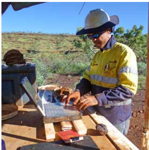
Geological logging at the Pilbara Iron Ore Project, March 2011.

Since the discovery hole was drilled at the project late in 2008, drilling on the tenements has focussed on the iron mineralisation in the channels and these channels