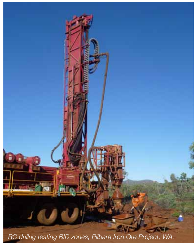
RC drilling testing BID zones, Pilbara Iron Ore Project, WA.

Significantly, these additional results - which follow the first batch of assays from the 2011 BID drilling program announced on 14 October 2011 - highlight new zones with excellent BID intersections, providing confidence in Flinders' ability to further increase the resource base for the 100%-owned Pilbara Iron Ore Project (PIOP).