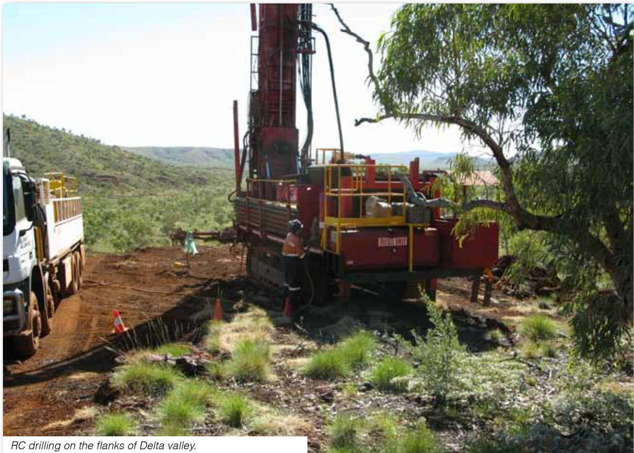
RC drilling on the flanks of Delta valley.