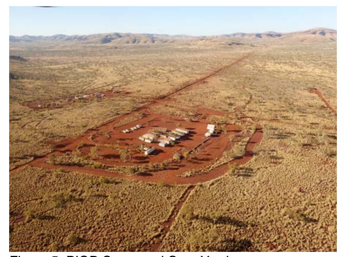
Figure 5: PIOP Camp and Core Yard