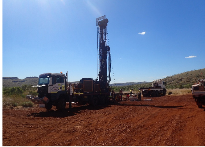
Figure 1: Sonic Rig